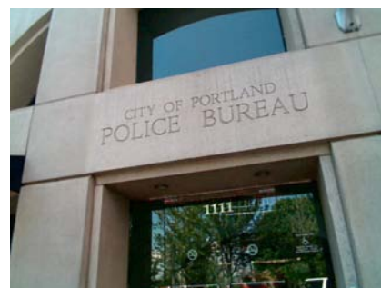
E Building Name