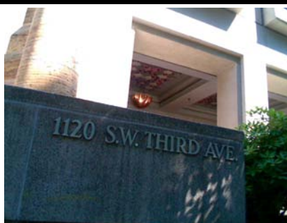
W Building Name