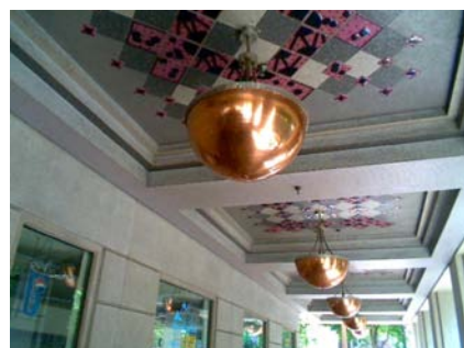
W Falling Hazard