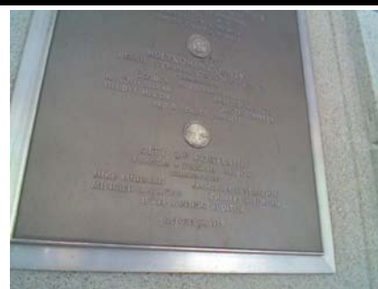
W Field Verified Year Built