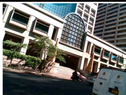
W Building Name