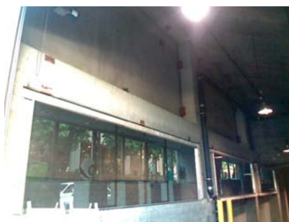
S Falling Hazard