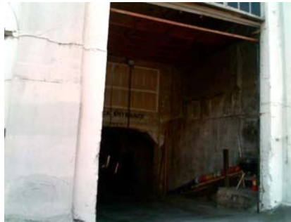
N Poor Condition ALSO SHOWS BASEMENT SPACE