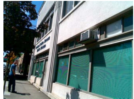
E Building Name