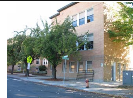
S General Site