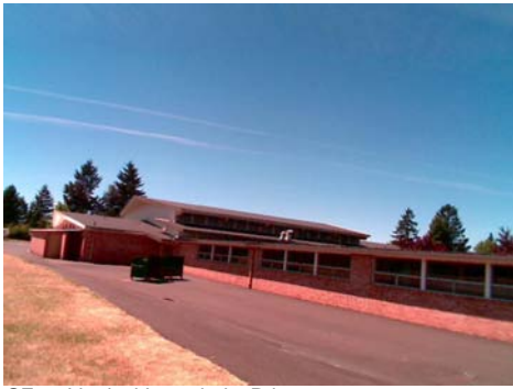
SE Vertical Irregularity Primary