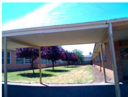
E Plan Irregularity Primary