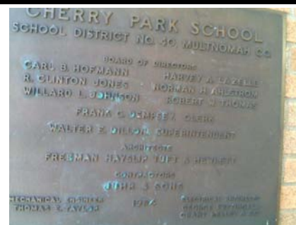
W Field Verified Year Built