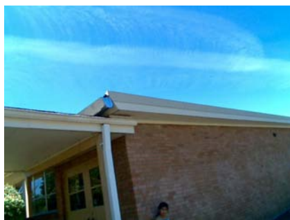
E Pounding Potential