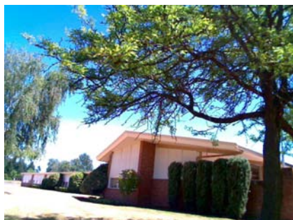
N Plan Irregularity Primary