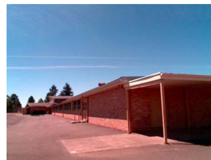
SE Elevation View