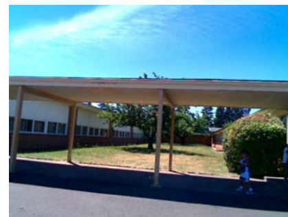
E Vertical Irregularity Primary