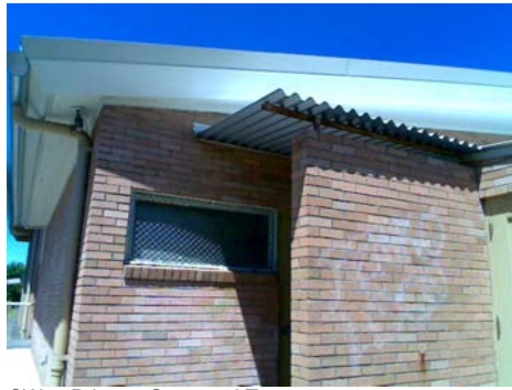
SW Primary Structural Type