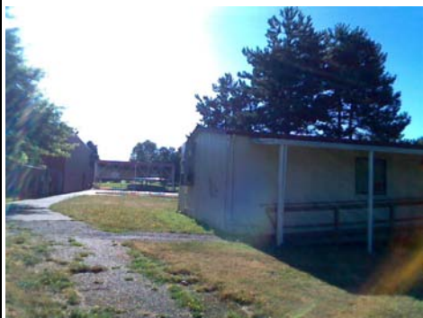
W General Site