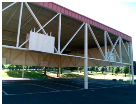
W General Site