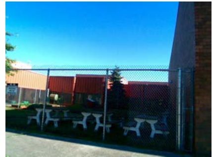
S Plan Irregularity Primary