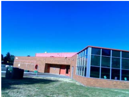
E Vertical Irregularity Primary