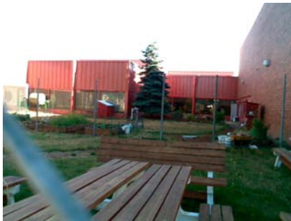
S Secondary Structural Type