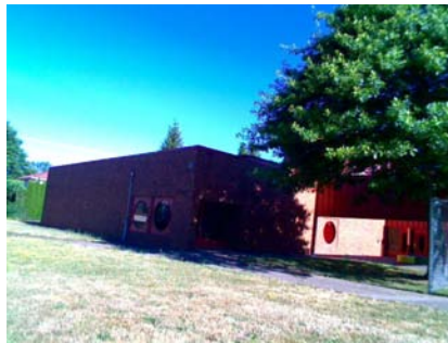
SE Elevation View