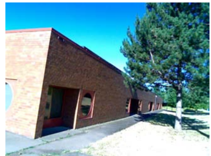
N Elevation View