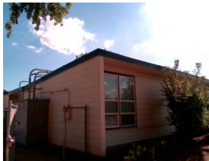
NE Elevation View