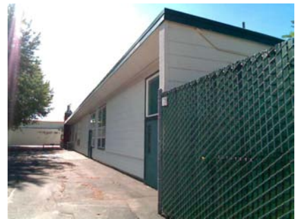
SE Elevation View