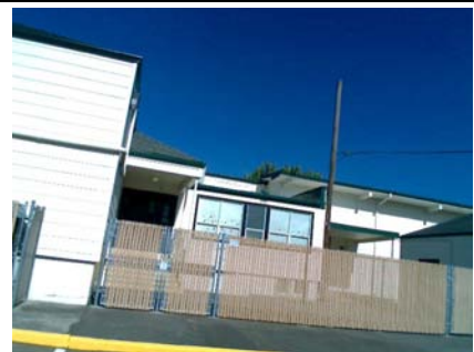
W Vertical Irregularity Primary