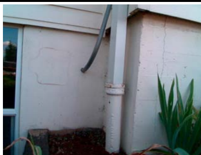
N Other CONN TO B