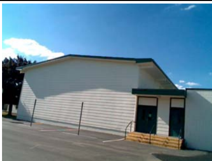
S Elevation View