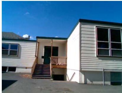
S Plan Irregularity Primary