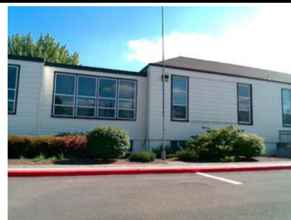
N General Site CONN TO B