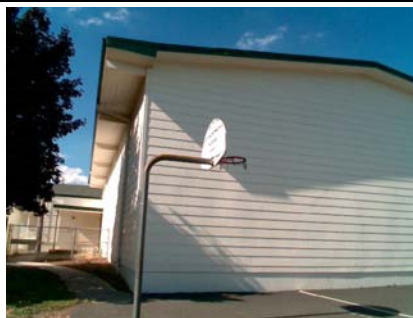
SW Primary Structural Type