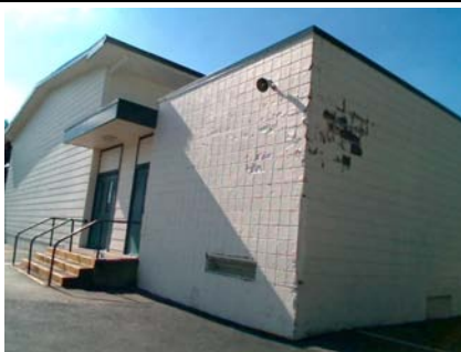
SE Primary Structural Type