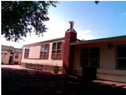
S Falling Hazard