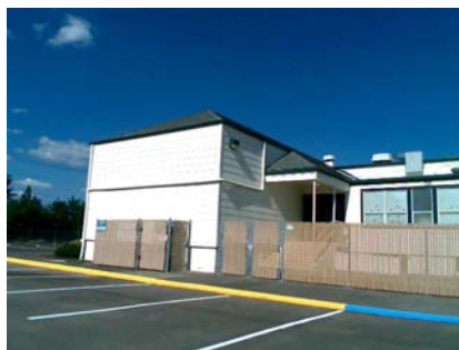
SW Plan Irregularity Primary