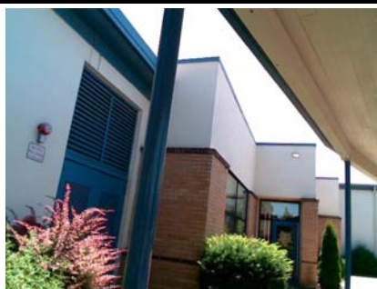
W Plan Irregularity Primary