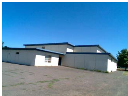
SW Vertical Irregularity Primary