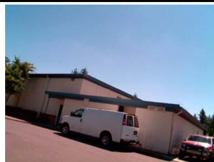
NW Vertical Irregularity Primary