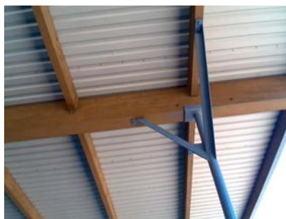
E Falling Hazard