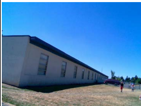
NE Plan Irregularity Secondary