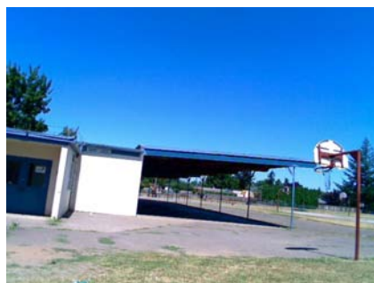
S Falling Hazard