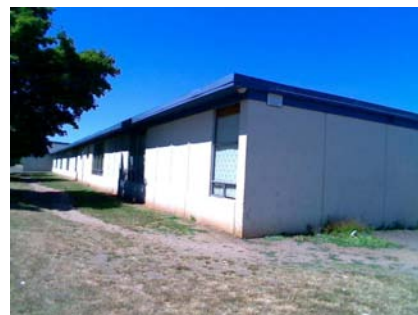
SE Elevation View