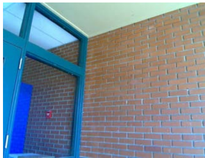
S Primary Structural Type