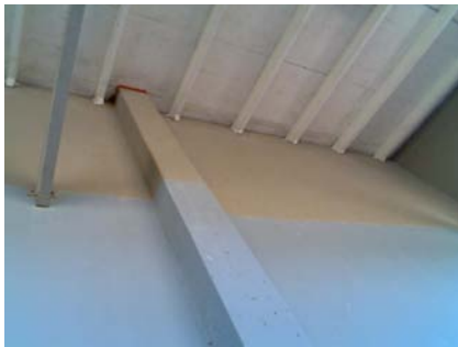
N Secondary Structural Type