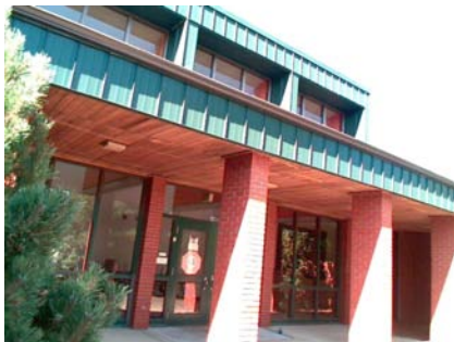
S Other DIAPHRAGM HOLE