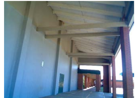
E Falling Hazard