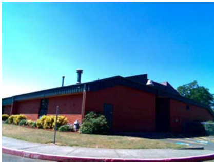
SE Vertical Irregularity Primary