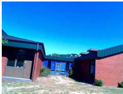
W Other A TO B CONN