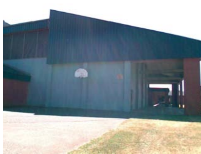
E Secondary Structural Type