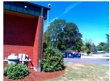
S Primary Structural Type