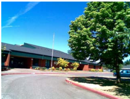
S Vertical Irregularity Primary