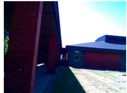
E Plan Irregularity Secondary