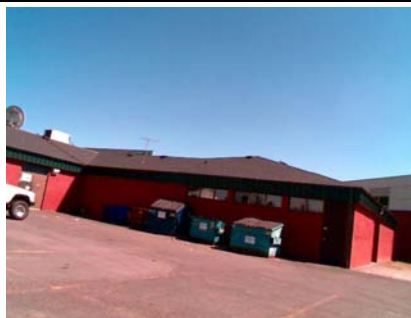
NW Plan Irregularity Primary