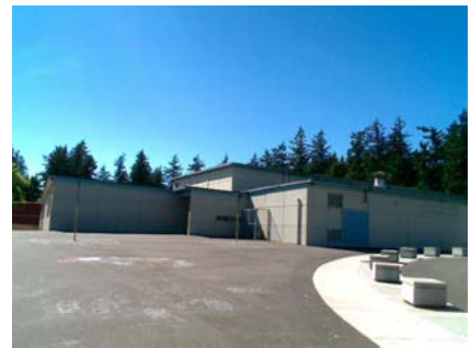
SE Vertical Irregularity Primary