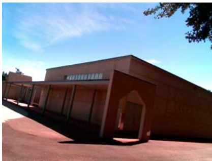
NE Elevation View