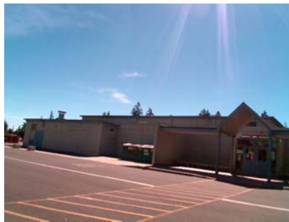
E Vertical Irregularity Primary