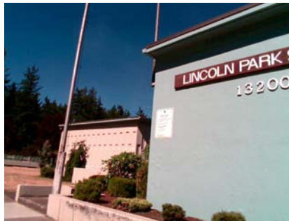
W Building Name