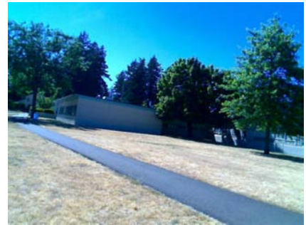
SE Plan Irregularity Primary