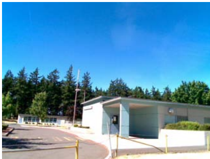
SW Plan Irregularity Primary