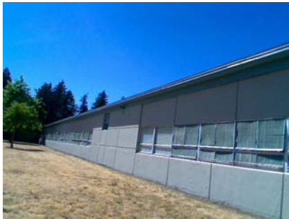
SE Elevation View