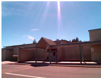
E Vertical Irregularity Primary