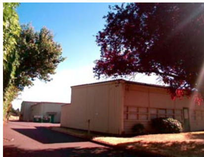
NE Number of Stories