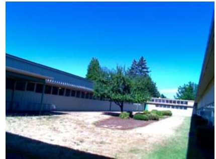
W Vertical Irregularity Primary