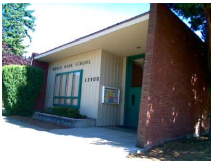
N Secondary Structural Type