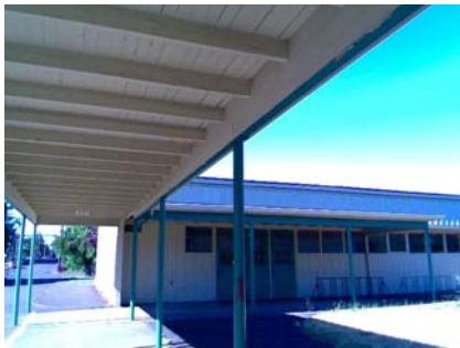
SW Falling Hazard