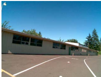
SW Primary Structural Type