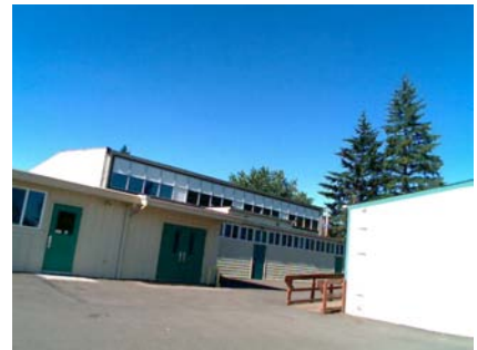
S Vertical Irregularity Primary