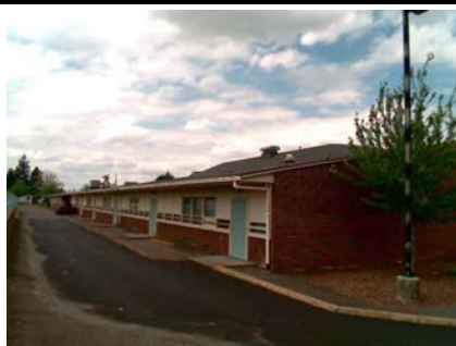
SE Elevation View