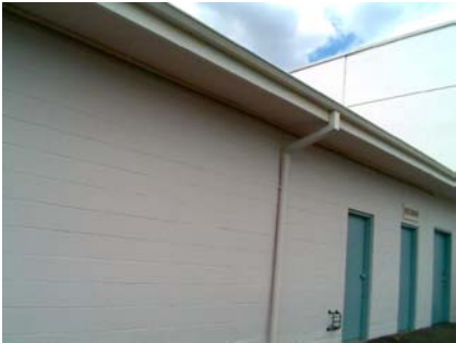
E Primary Structural Type