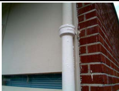
SE Primary Structural Type