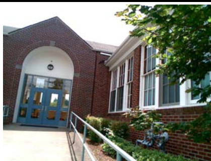
N Other CONN TO NEWER SECT - SEIS JT ABOUT 2"