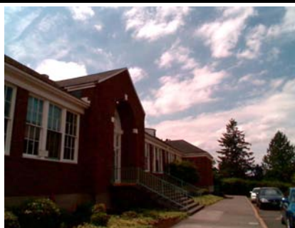
N Falling Hazard