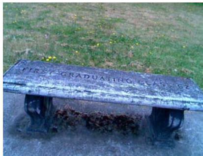
S Field Verified Year Built