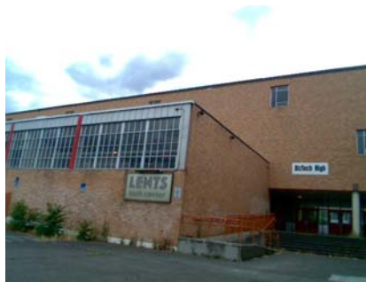
W Building Name