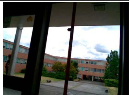
E Vertical Irregularity Secondary