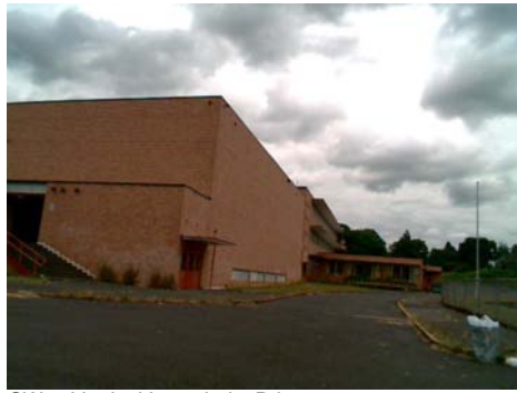
SW Vertical Irregularity Primary