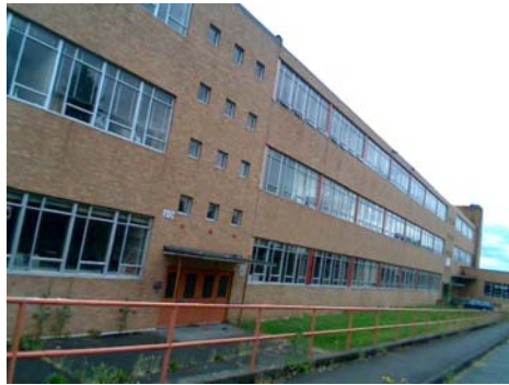
N Falling Hazard