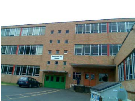
N Building Name