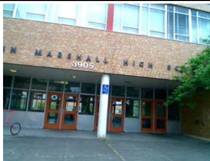
E Plan Irregularity Primary