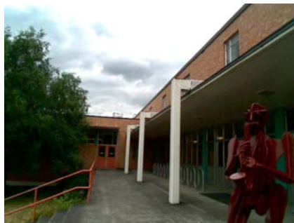
NW Vertical Irregularity Primary