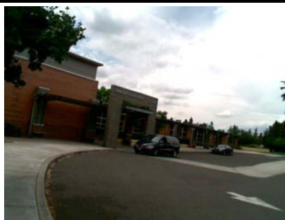
NE Plan Irregularity Primary NEW FRONT CANOPY