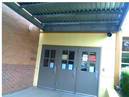
N Other SECURE CANOPIES