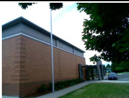
NE Primary Structural Type NEW BRICK COVERS OLD CONC STRUCTURE