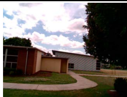
NW Plan Irregularity Tertiary CONN TO NEW SECTION