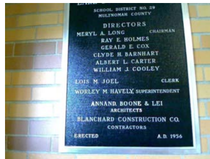
N Field Verified Year Built