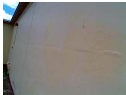
E Other FORM MARKS IN OLD CONC WALL