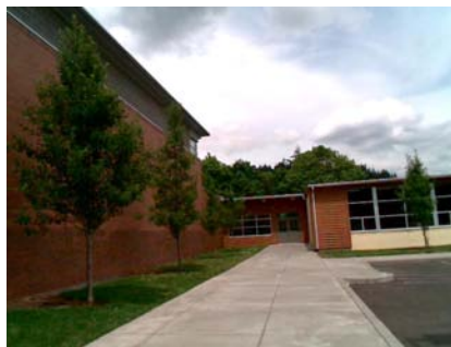
S Elevation View CONN TO NEW SECTION