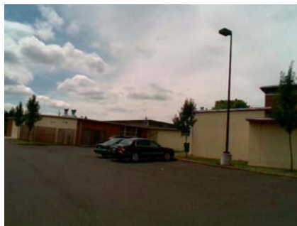
E Plan Irregularity Secondary