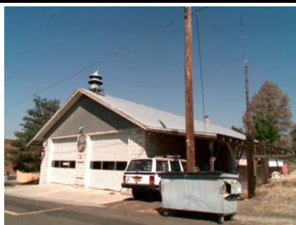
SE Falling Hazard