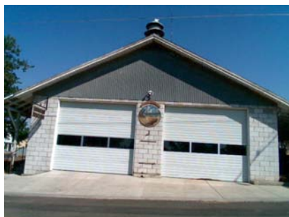
S Plan Irregularity Primary