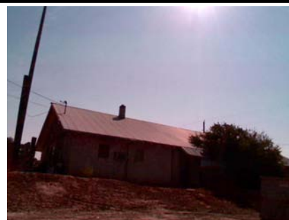
NW Elevation View