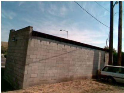
NW General Site BACK OF OLD FS