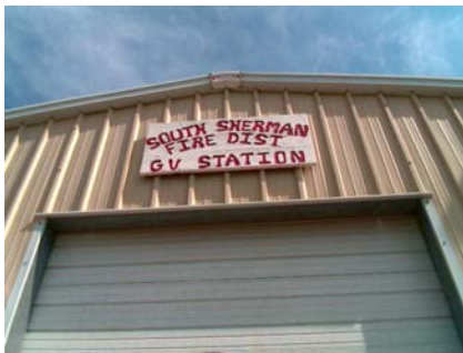
W Building Name AND BUTLER LOGO