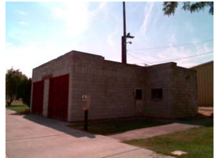
NE General Site OLD FS USED FOR STORAGE-118 1ST