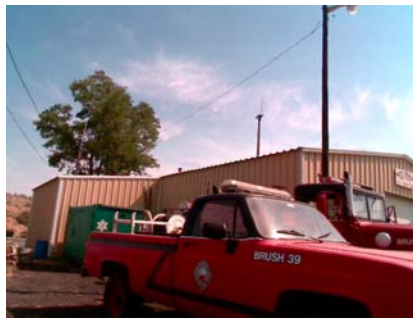
NW Plan Irregularity Primary