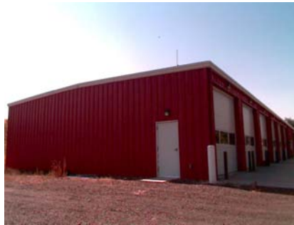
NE Elevation View