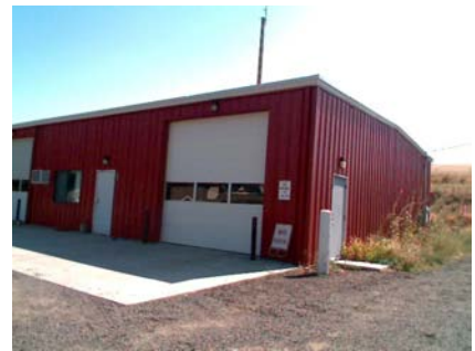
NW Elevation View