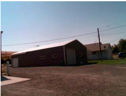
NE General Site

THIS WAS THE GARAGE NEXT DOOR, BUT I'M PRETTY SURE IT'S NOT PART OF THE SITE. THERE WAS A PIGSTY BEHIND THIS BLDG WITH 3 HUGE PIGS.