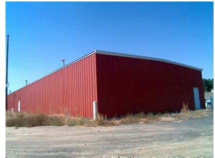
SE Elevation View