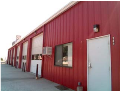
N Elevation View