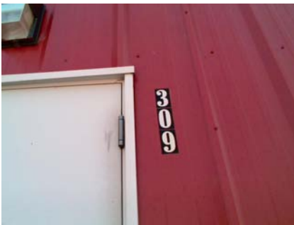
N Building Name