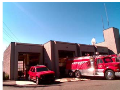
E Plan Irregularity Secondary