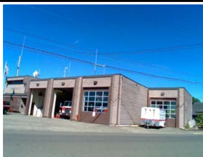
S Plan Irregularity Primary