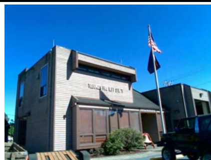
W Number of Stories