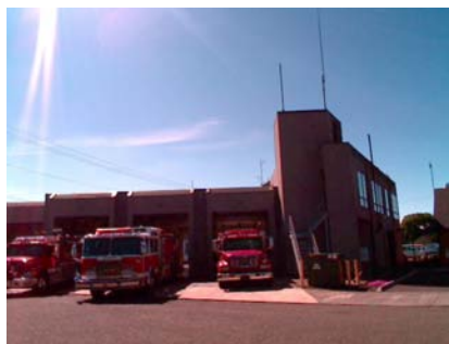
NE Vertical Irregularity Primary