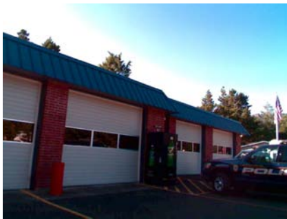
E Plan Irregularity Primary