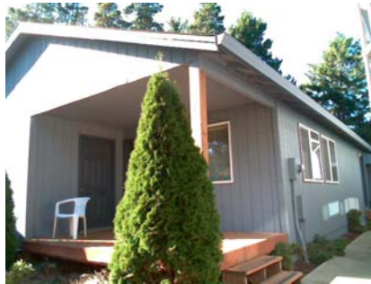
SE General Site paramedics bldg