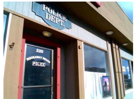
W Building Name