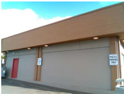
N Elevation View