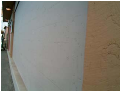
N Primary Structural Type FORM MARKS