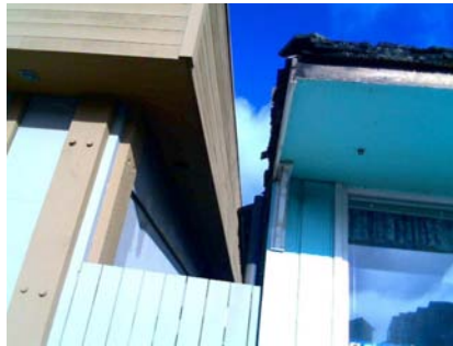
SW Elevation View NO POUNDING