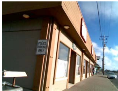
NW Plan Irregularity Primary