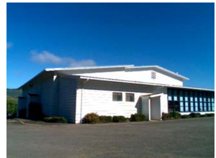
SW Vertical Irregularity Primary