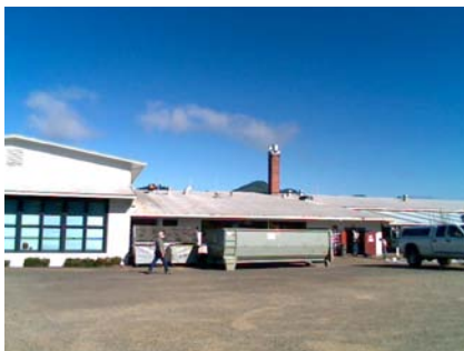
S Falling Hazard