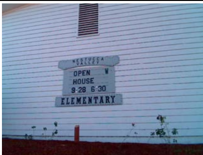
N Building Name