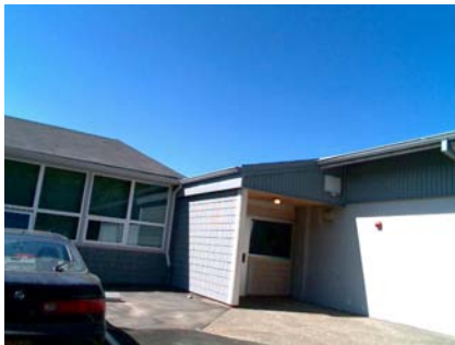
E Vertical Irregularity Secondary conn to d