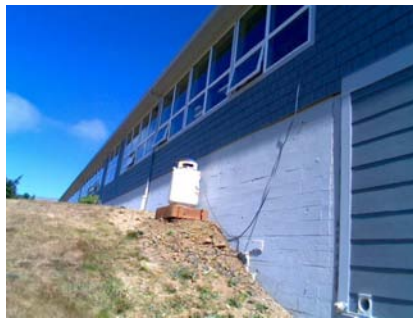
W Vertical Irregularity Secondary