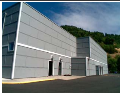
SW Plan Irregularity Primary