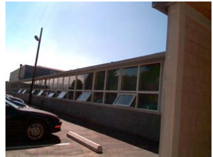
E Elevation View