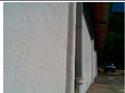
S Primary Structural Type cmu-shape patterns in skim coat between cols