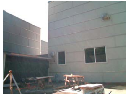
NE Vertical Irregularity Primary conn to c