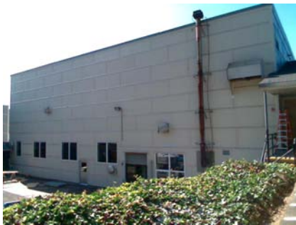
NE Elevation View