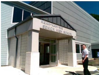
SW Building Name cmu @ entry