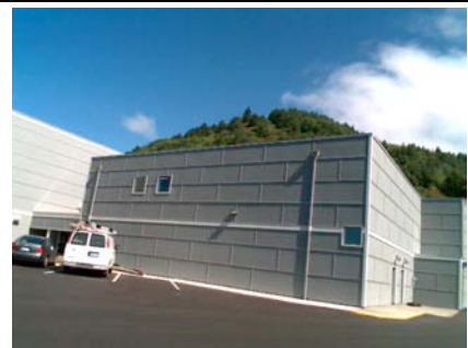
SW Plan Irregularity Secondary conn to b