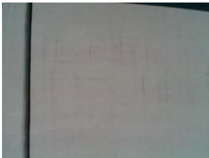
S Primary Structural Type more cmu patterns