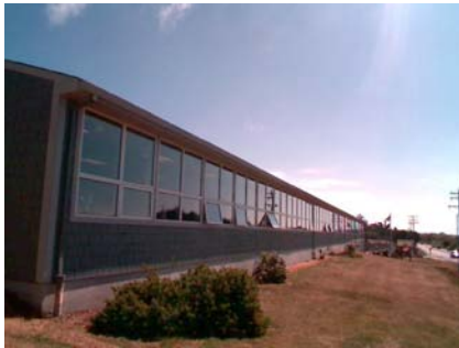
W Elevation View