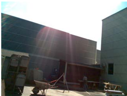
N Elevation View conn to b