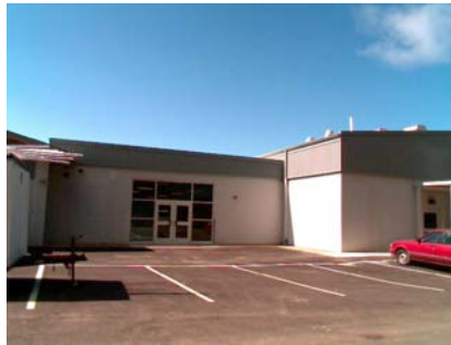
E Plan Irregularity Primary