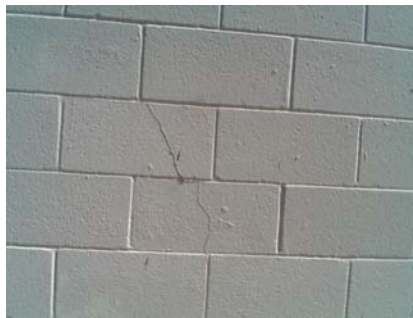
W Poor Condition