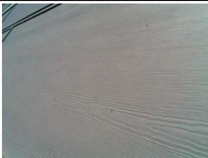
S Primary Structural Type nails in new siding