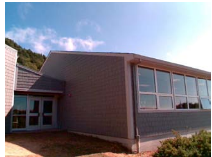
NW Vertical Irregularity Primary conn to f