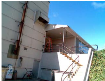
E Vertical Irregularity Secondary conn to a