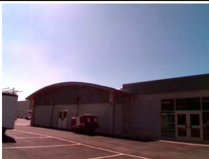
NE Plan Irregularity Primary