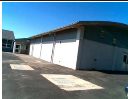
SE Elevation View