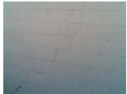
N Poor Condition