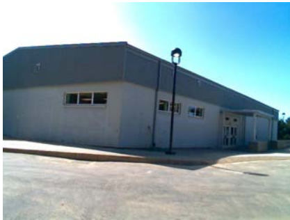
NE Elevation View