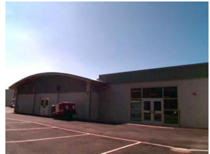
E Plan Irregularity Secondary