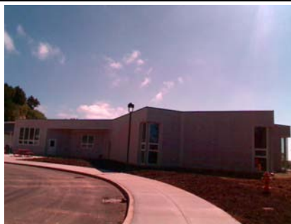
N Plan Irregularity Primary