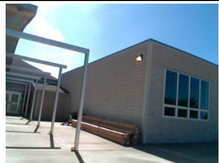
NE Vertical Irregularity Primary