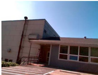
E Vertical Irregularity Secondary conn to b