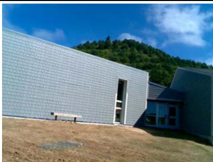
SW General Site conn to a