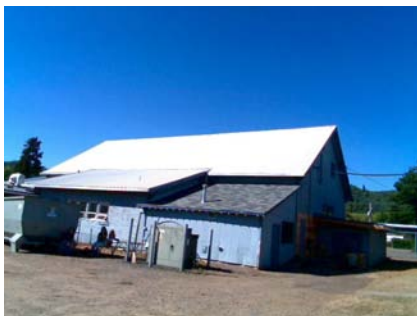
SE Elevation View OLDEST PART OF SCHOOL