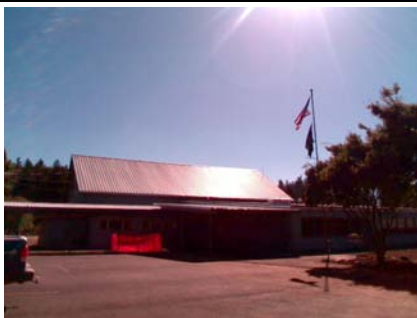
N Vertical Irregularity Primary