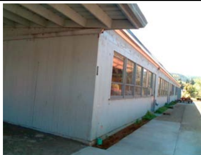
N Elevation View