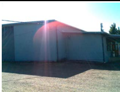
NE Vertical Irregularity Primary