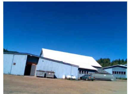
S Vertical Irregularity Primary