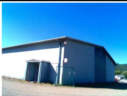
SE Elevation View