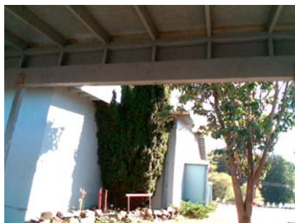
NW Plan Irregularity Primary