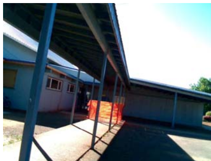
NE Falling Hazard