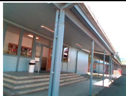
N Falling Hazard