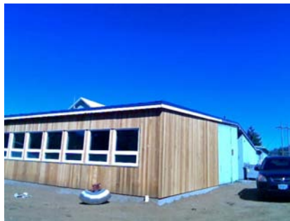
SW Building Quality LIBRARY IMPROVEMENT THIS CORNER PER BOND MEASURE