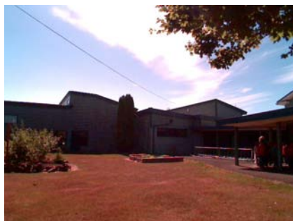
N Vertical Irregularity Primary