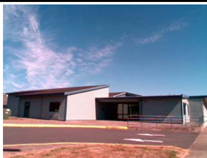
SW Plan Irregularity Primary