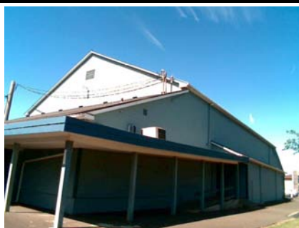
SE Vertical Irregularity Primary