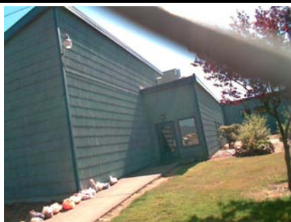
NW Plan Irregularity Primary