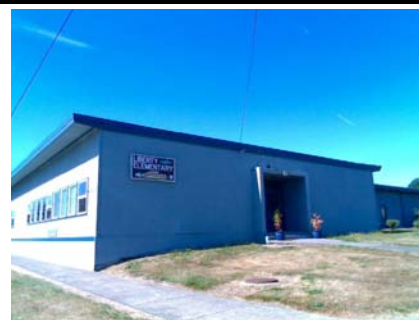
SE Primary Structural Type STUCCO END WALL