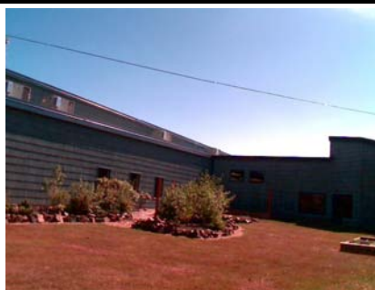
NW Vertical Irregularity Secondary