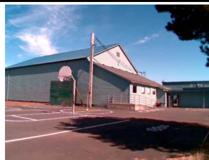
SW Plan Irregularity Secondary