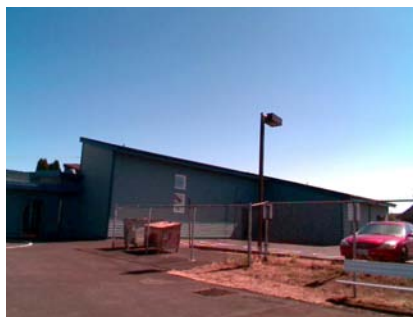
NW Vertical Irregularity Secondary