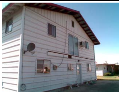
N Elevation View