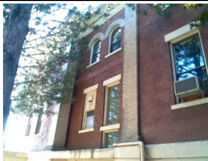
S Elevation View