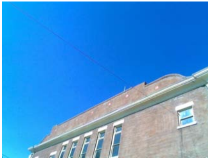
W Seismic Upgrade