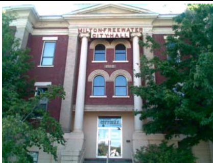
E Field Verified Year Built