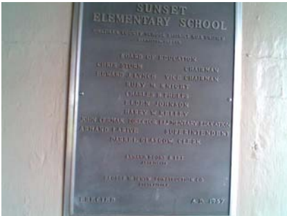
E Field Verified Year Built