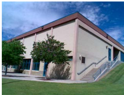
SE Vertical Irregularity Secondary