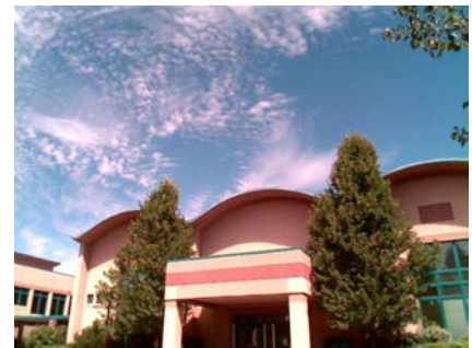
W Primary Structural Type