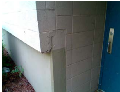
NW Primary Structural Type