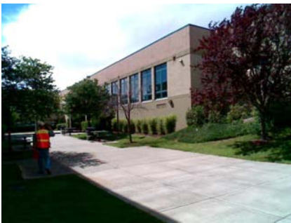
SE General Site