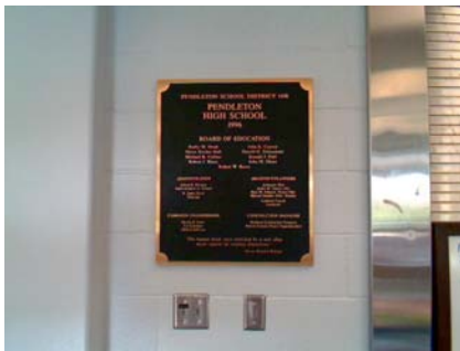
S Field Verified Year Built