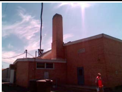
NE Falling Hazard