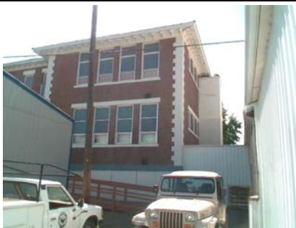
NE Elevation View