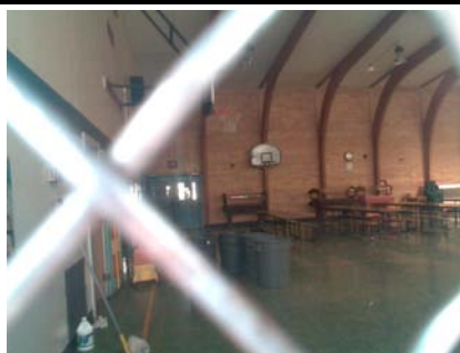
N Primary Structural Type