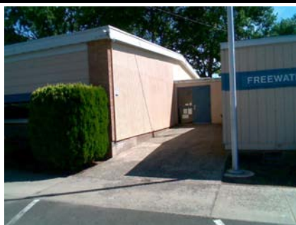
NW Elevation View