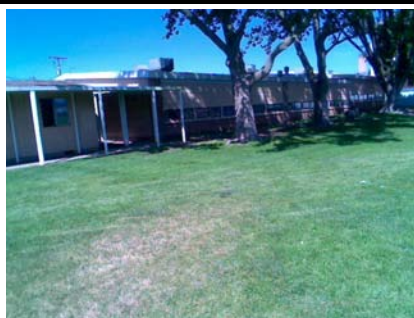
S Elevation View