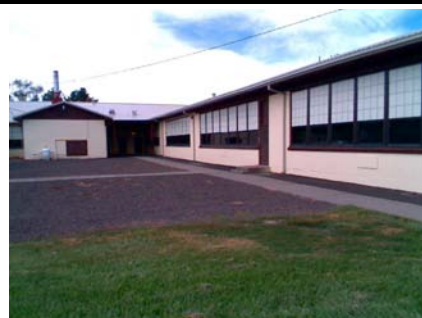
SW Elevation View attach w/building b