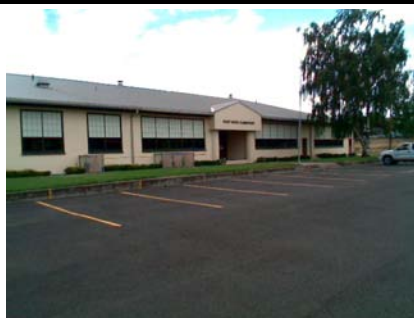
N Elevation View