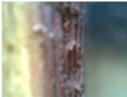
W Primary Structural Type double wythe