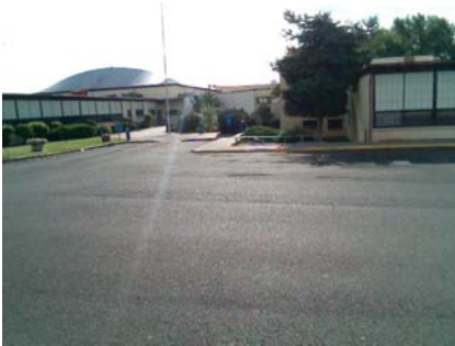
E Elevation View