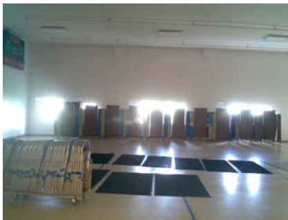
W Primary Structural Type note corbeling on columns