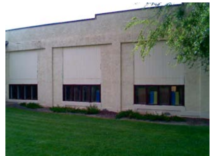
E Elevation View