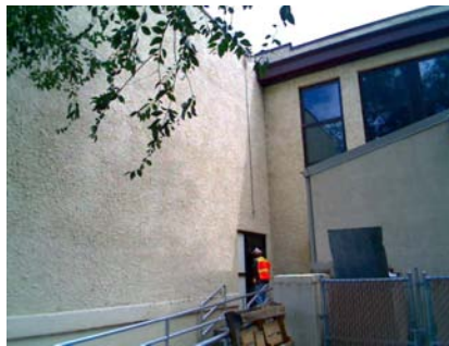
S Plan Irregularity Primary