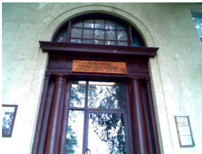
W Field Verified Year Built