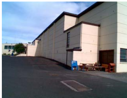
NW Elevation View