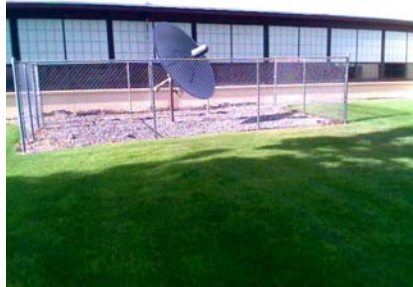
S Elevation View