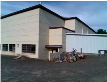
W Elevation View