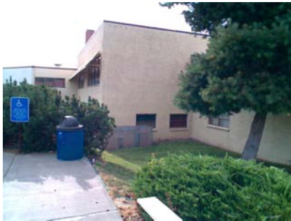
NE Elevation View