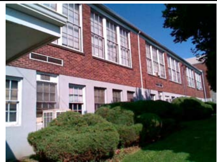
E Elevation View