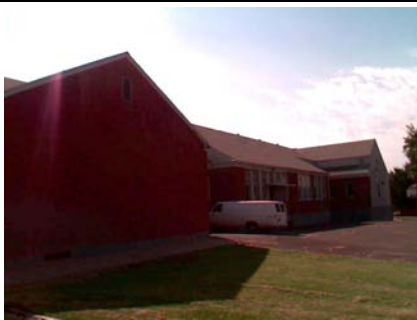
NW Elevation View