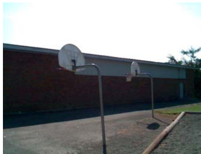
W Elevation View