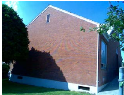
E Elevation View