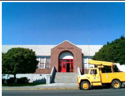
E Elevation View