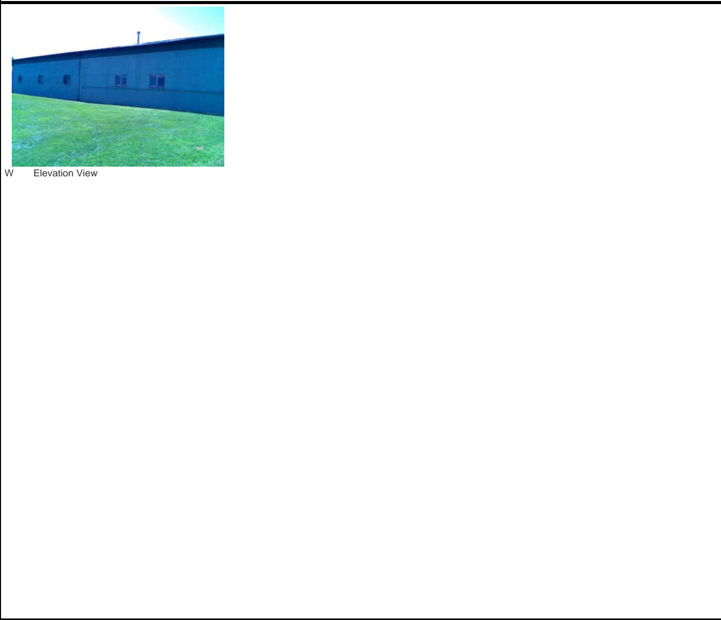
W Elevation View