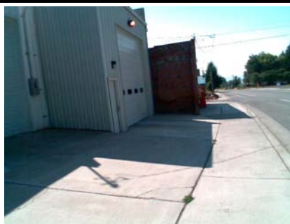
NE Plan Irregularity Primary