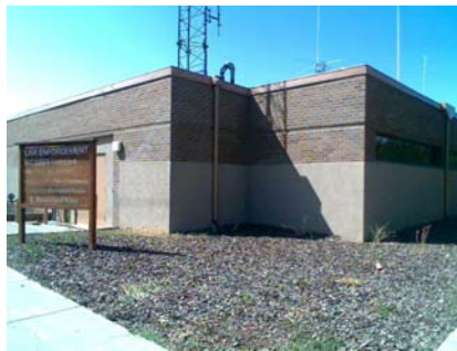
SE Plan Irregularity Primary