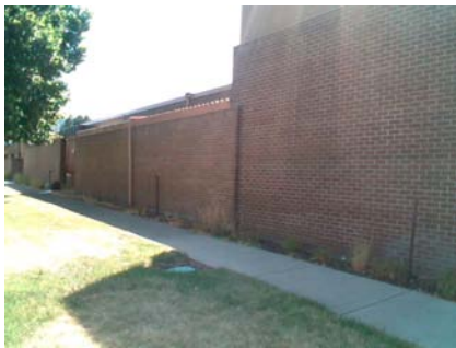
NE Elevation View