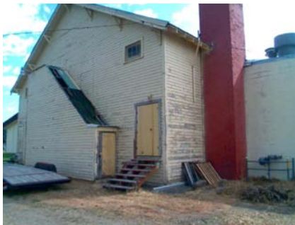
SW Elevation View