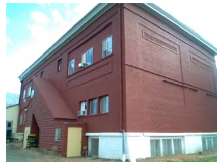
SW Elevation View