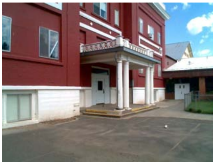
SE Falling Hazard