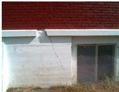
S Poor Condition