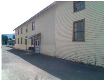
NW Elevation View