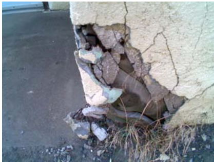
NE Primary Structural Type