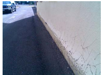
N Poor Condition stucco bubbling off