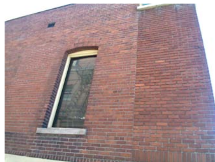
N Primary Structural Type