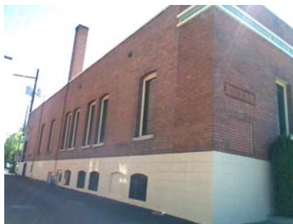
N Falling Hazard