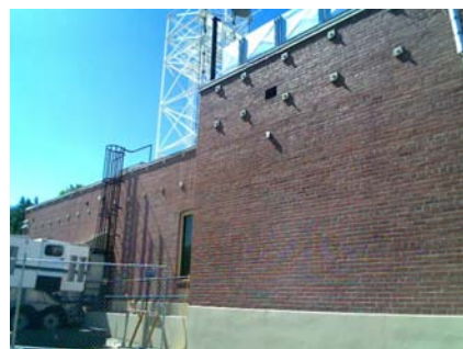
E Seismic Upgrade only on e side