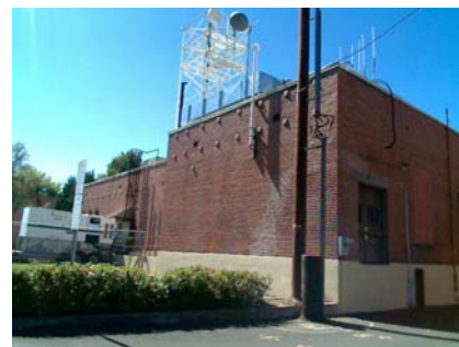
E Plan Irregularity Primary