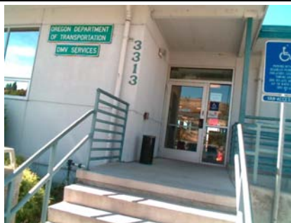
S Building Name