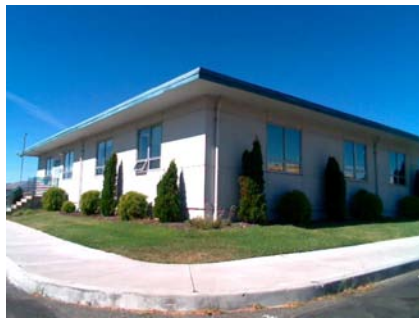
SW Elevation View addn end