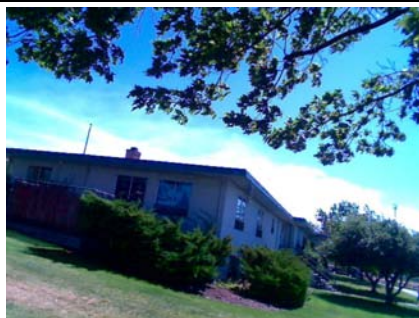
NE Plan Irregularity Secondary