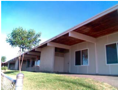
NW Plan Irregularity Secondary