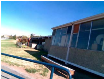
NW Plan Irregularity Secondary