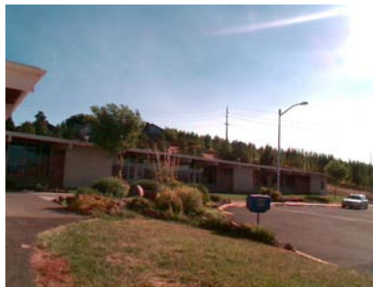
NE Plan Irregularity Secondary