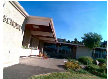
N Falling Hazard