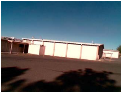
W Primary Structural Type c2 on gym