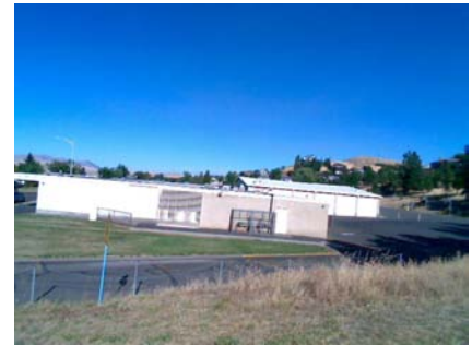
W Vertical Irregularity Primary