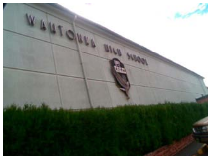
W Building Name