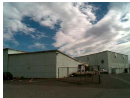
SW Vertical Irregularity Primary