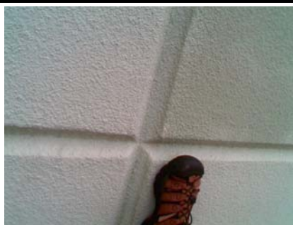
W Primary Structural Type solid jts