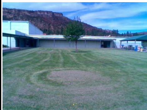
E Elevation View