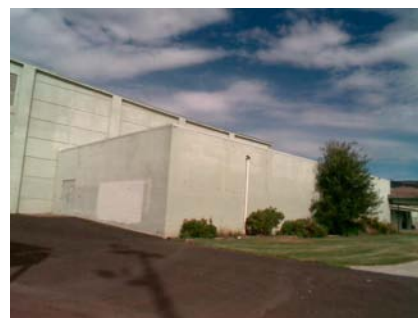
E Secondary Structural Type