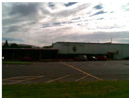
W Vertical Irregularity Primary