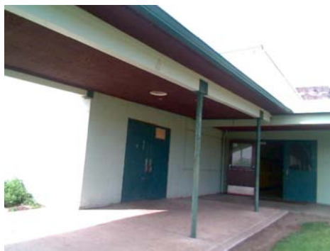
NE Pounding Potential and rm/c2 boundary