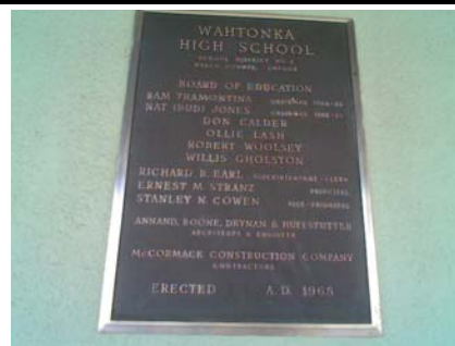
W Field Verified Year Built 1965