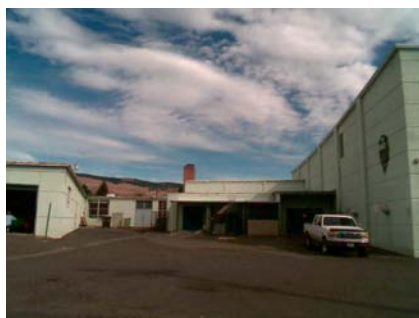
S Plan Irregularity Primary and chimney