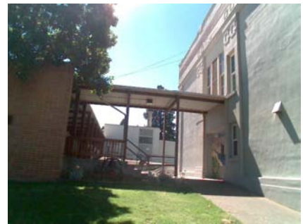
NE Pounding Potential