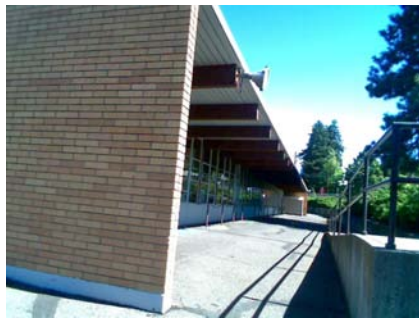
W Falling Hazard