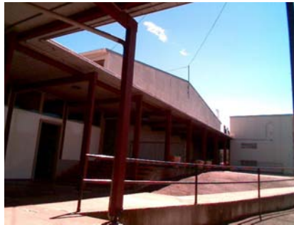
NW Vertical Irregularity Primary