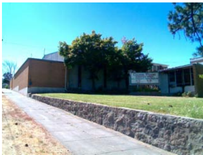
E Vertical Irregularity Primary