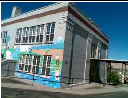
S Falling Hazard