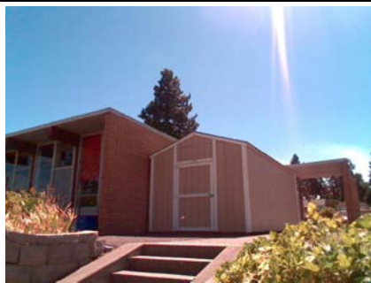
NW Secondary Structural Type