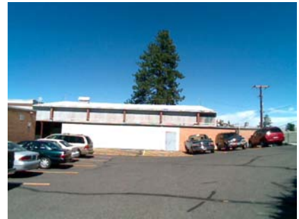
SW Elevation View