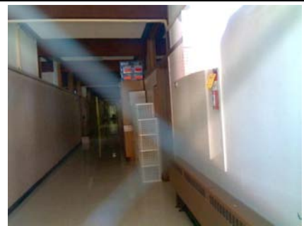
NW Primary Structural Type corr walls w clerestory