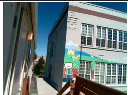
W Elevation View