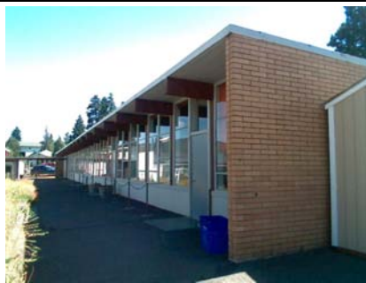
N Falling Hazard