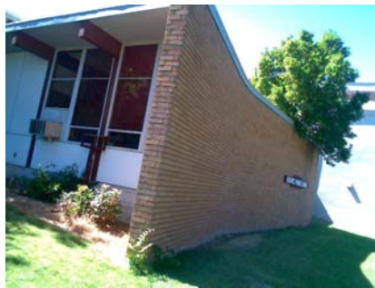
E Other wall detail