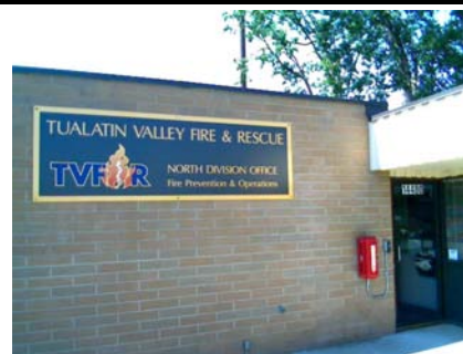
N Building Name