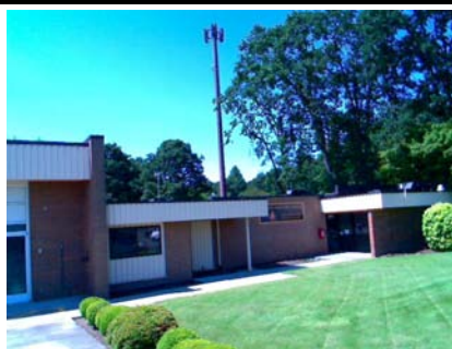
N Plan Irregularity Primary