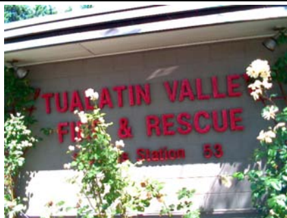
W Building Name