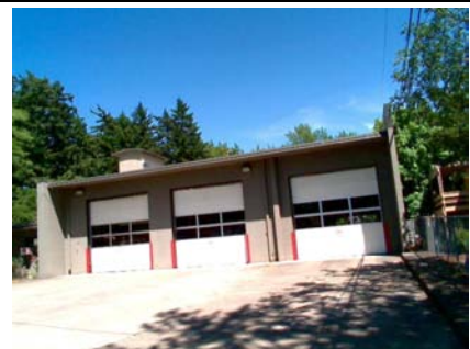
W General Site