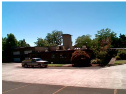
E General Site