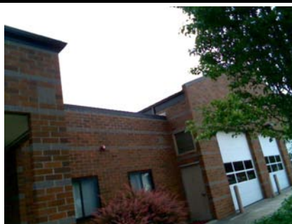
S Plan Irregularity Primary