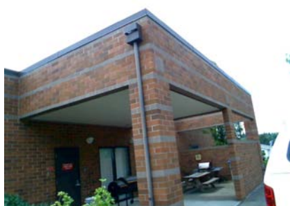
S Falling Hazard