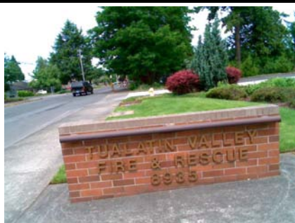
E Building Name