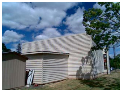
SW Plan Irregularity Primary