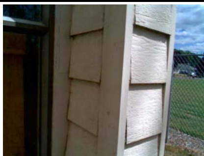
SW Primary Structural Type Wood