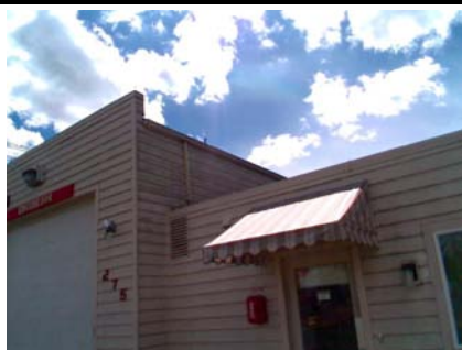
N Vertical Irregularity Primary