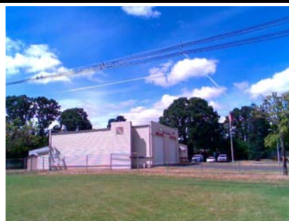
SE General Site