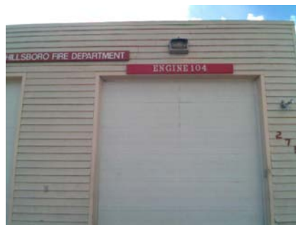
N Building Name