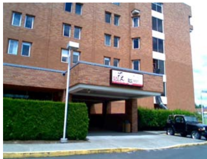
SE Falling Hazard Heavy cantilevered covered walkway