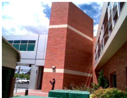
SE Plan Irregularity Primary