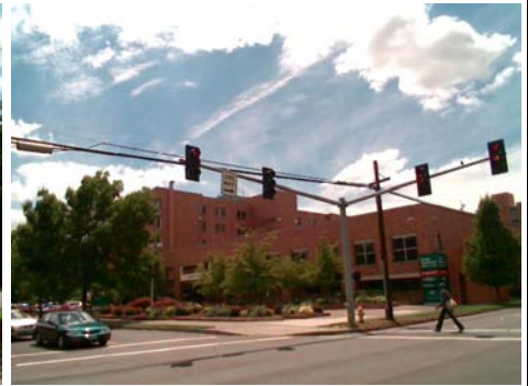
N General Site