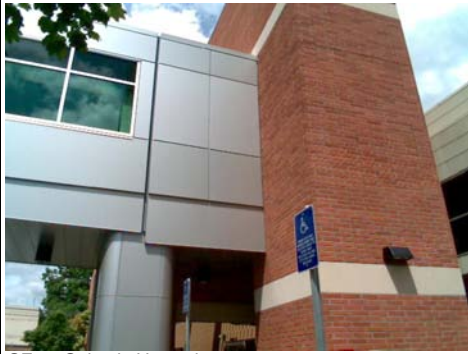
SE Seismic Upgrade walkway to new bldg has 4" seismic joint.