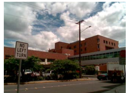
NW General Site