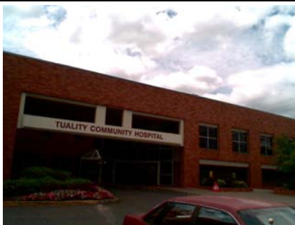
NE Building Name