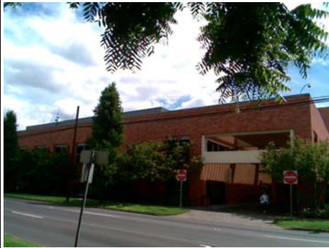
NW General Site