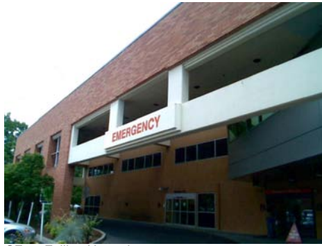
SE Falling Hazard Concrete suspended beam