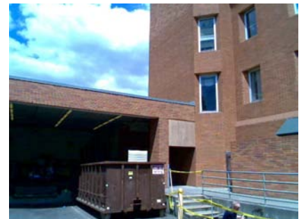
S Vertical Irregularity Primary