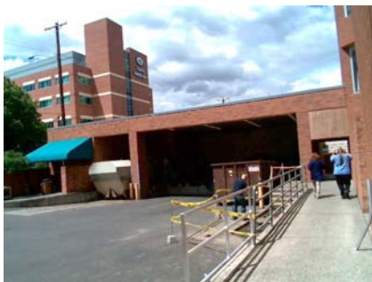
E General Site