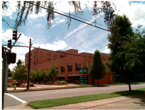
NE General Site