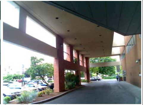
S Falling Hazard