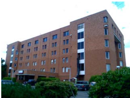
SE General Site