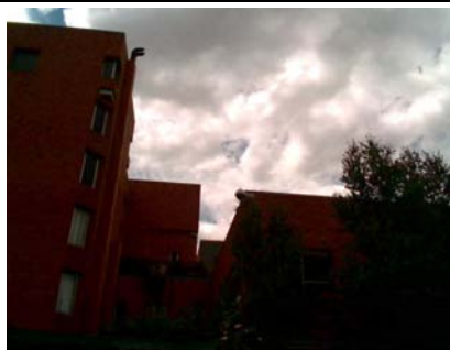
NE Vertical Irregularity Primary 6 stories on left side