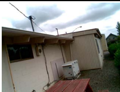
NW Plan Irregularity Primary Bldg A is in front left bldg B is back right.