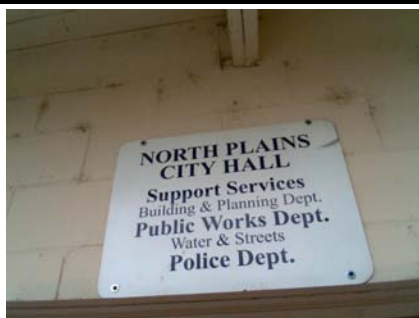
E Building Name