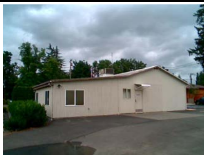
SW General Site Back of Bldg B