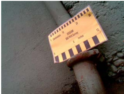
NE Poor Condition very worn C2 wall against RM1.

Bad photo, there is a C2 wall on the right side of the photo with