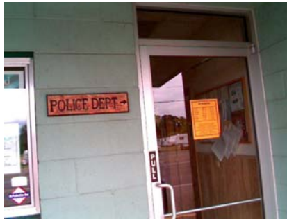
NE Building Name

Bad photo, there is a C2 wall on the right side of the photo with