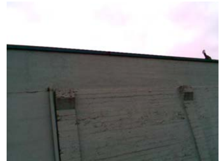
N Falling Hazard