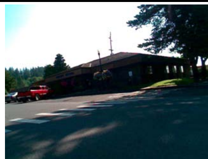
SW General Site