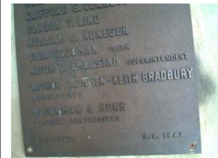
W Field Verified Year Built 1963