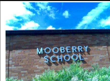
S Building Name