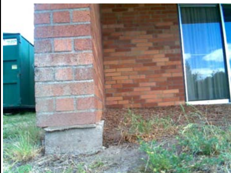
NW Poor Condition Other wall sliding off foundation