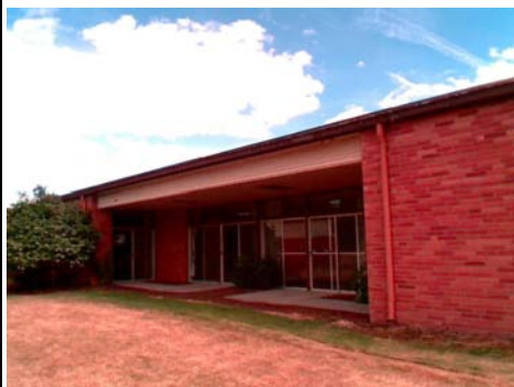
NW General Site