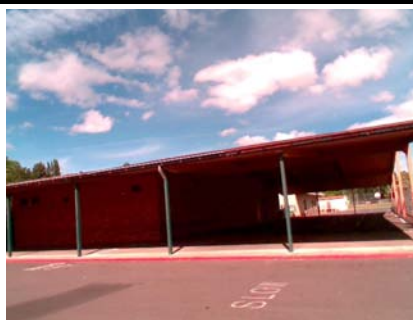
W General Site