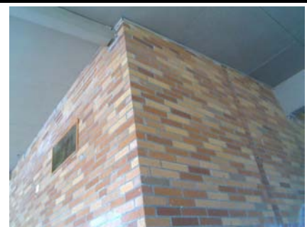
SW Falling Hazard