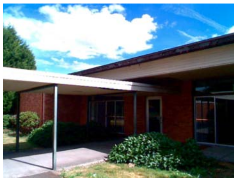
NE Pounding Potential