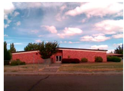
W General Site