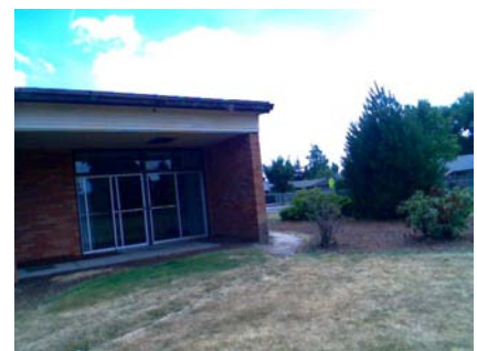
N Poor Condition full view of last photo