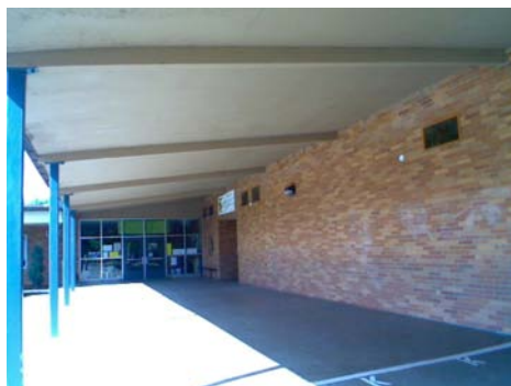
SW General Site