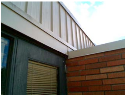
SE Primary Structural Type