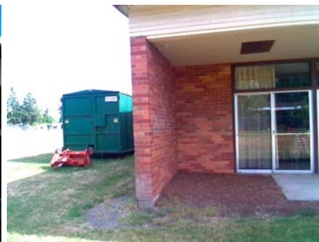
N Poor Condition