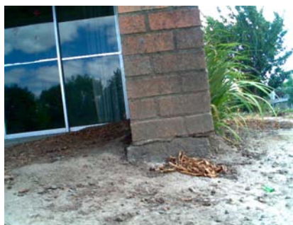
NW Poor Condition Wall sliding off foundation