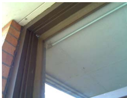
N Primary Structural Type Wood