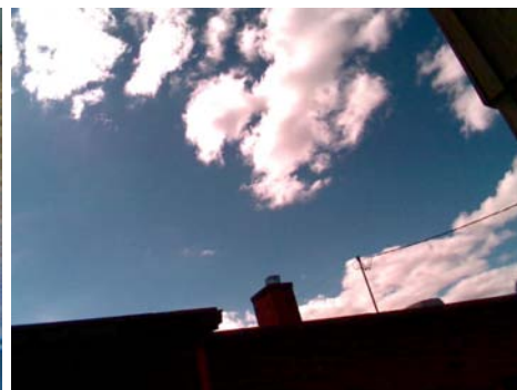
E Falling Hazard