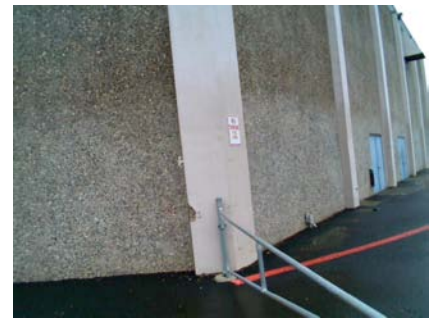
W Poor Condition