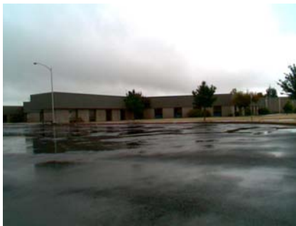
W General Site