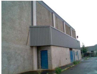
N Pounding Potential