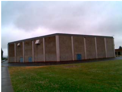
NE Plan Irregularity Secondary