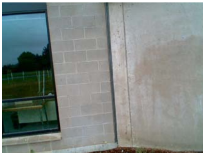
N Seismic Upgrade