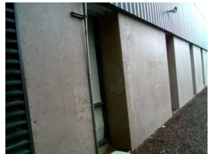
NE Primary Structural Type