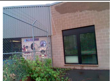
E General Site