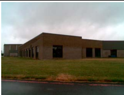
NE General Site