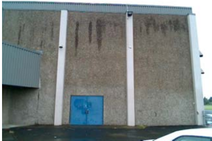
W General Site