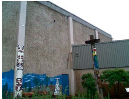
N Poor Condition