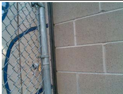
W Seismic Upgrade