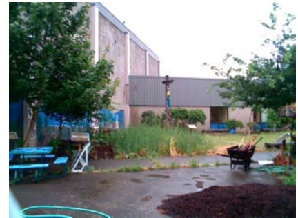
NE Pounding Potential