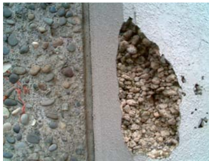
SW Poor Condition