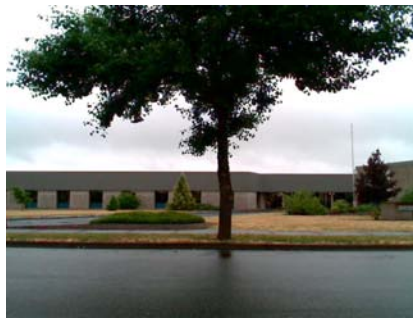
W General Site