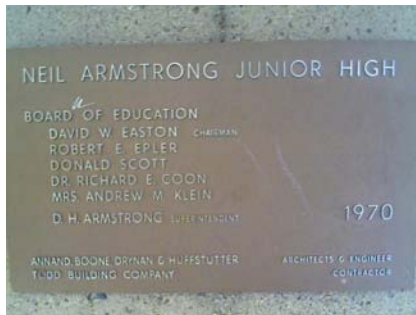
N Field Verified Year Built 1970